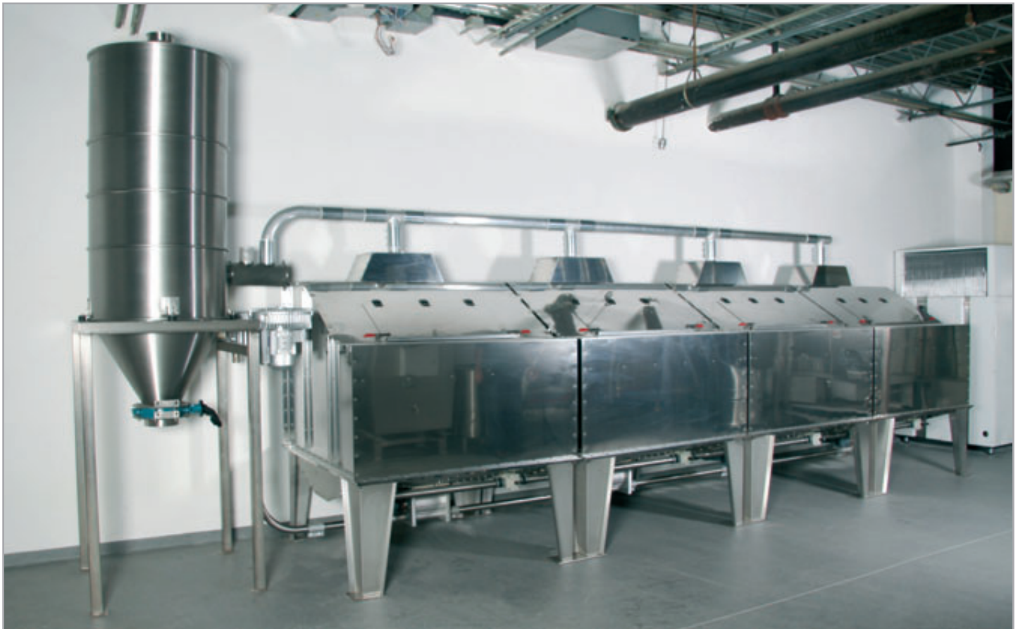
dust exhaustion hood with liquid dosing

dust exhaustion station, 4 dumping stations